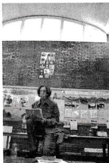
Tell us who you are, dear poet!